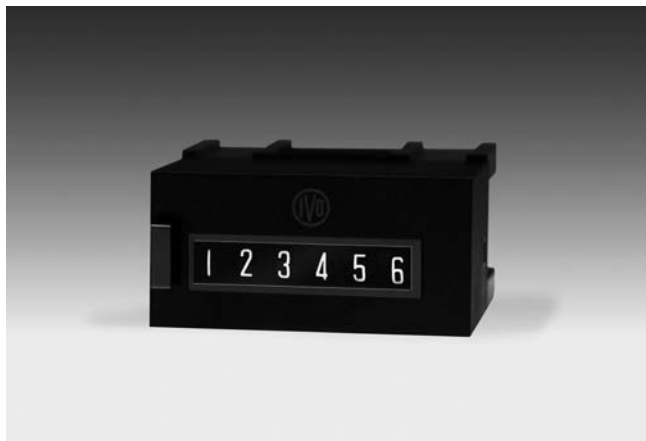
F 304 - Socket box