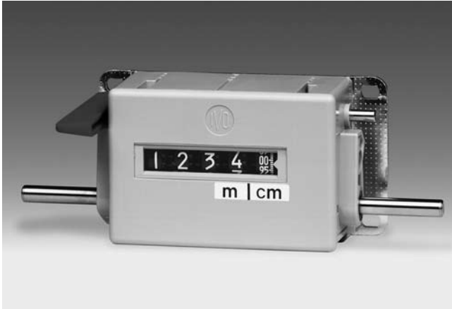
M 410.A - PTB Meter counter