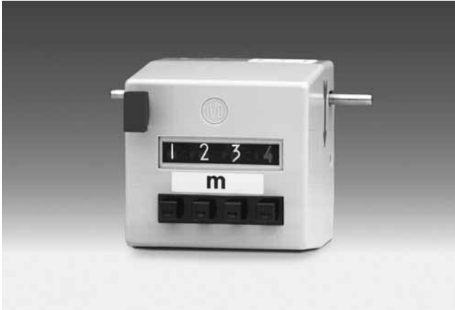
ME102 - Meter counter