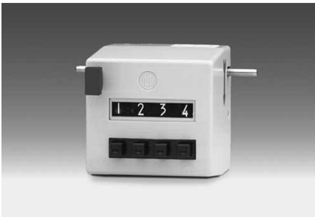
UE102 - Revolution counter